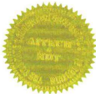
NGUYEN HONG THANG ASNT Level III Cer. No: 332059